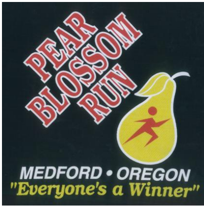
2011 shirt design