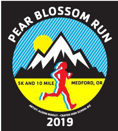
2019 shirt design