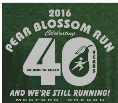
2016 shirt design