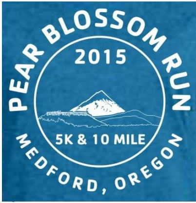
2015 shirt design