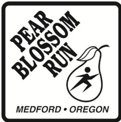
2010 and before