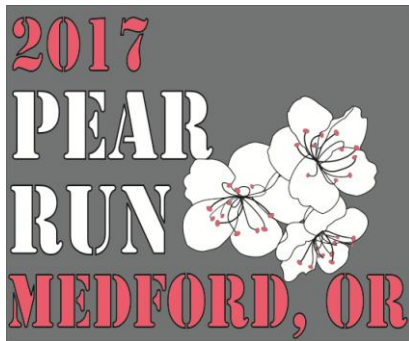
2017 shirt design