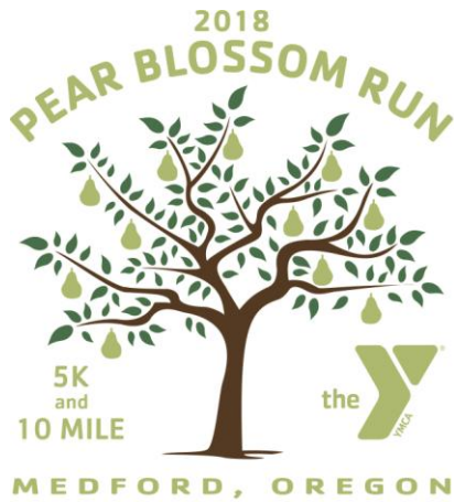
2018 shirt design