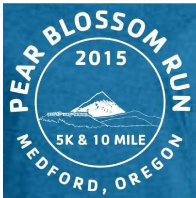
2015 shirt design